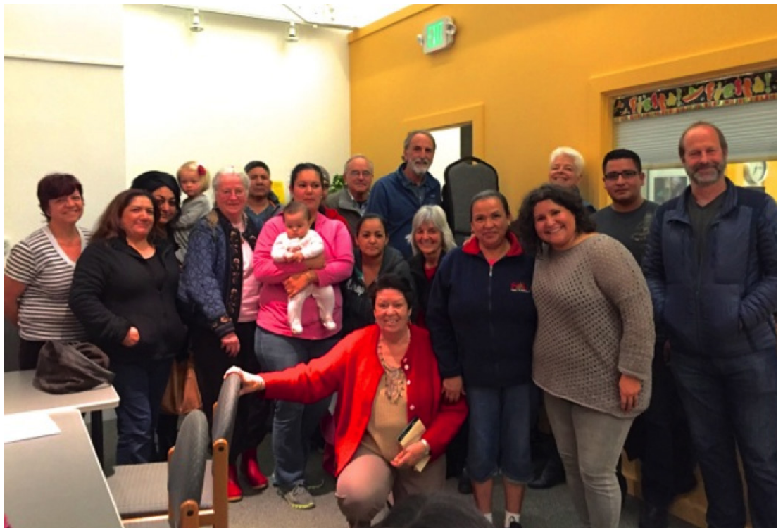
Abriendo Caminos and CLAM prepare for housing hearings

Though affordable housing is in need of much stronger support throughout the County, the geographic divide and distance between "East" and "West" Marin can make it difficult for affordable housing organizations and advocacy groups to work together. In late 2015, spurred by the upcoming County affordable housing workshops, CLAM reached out to convene affordable housing groups from across the County. This series of meetings has built relationships between West Marin groups—including San Geronimo Valley Affordable Housing