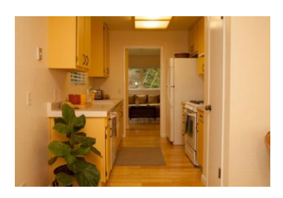
73 Inverness Way

Community Land Trusts, which now number more than 200 across the U.S. and abroad, create community ownership of land for the community's benefit in perpetuity. Community Land Trusts have creatively expressed the core concept of community ownership for community benefit in many areas, including land conservation, preservation of open space, and preserving land for community gardens. But creating permanently affordable home ownership has been a core defining activity of community land trusts for 40 years.